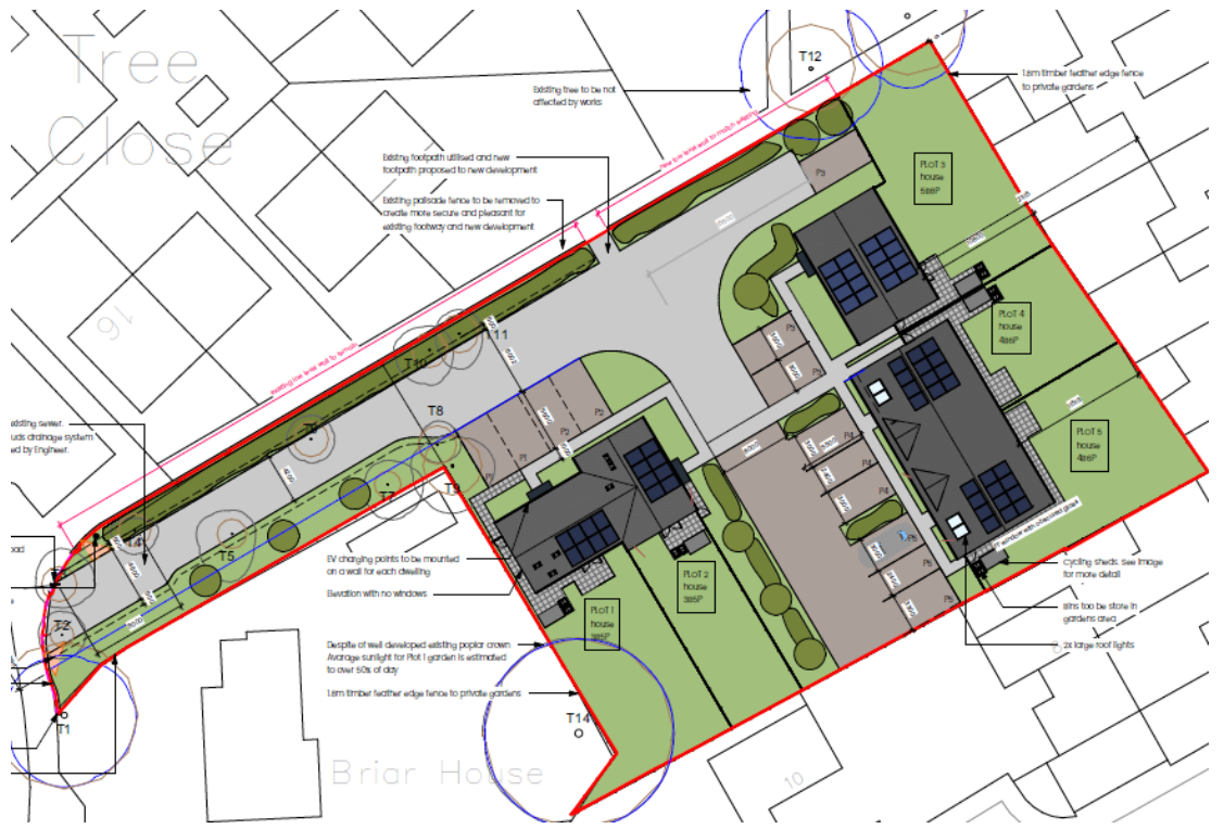
Extract from 0002 Rev P8 Site Plan and Site Location Plan