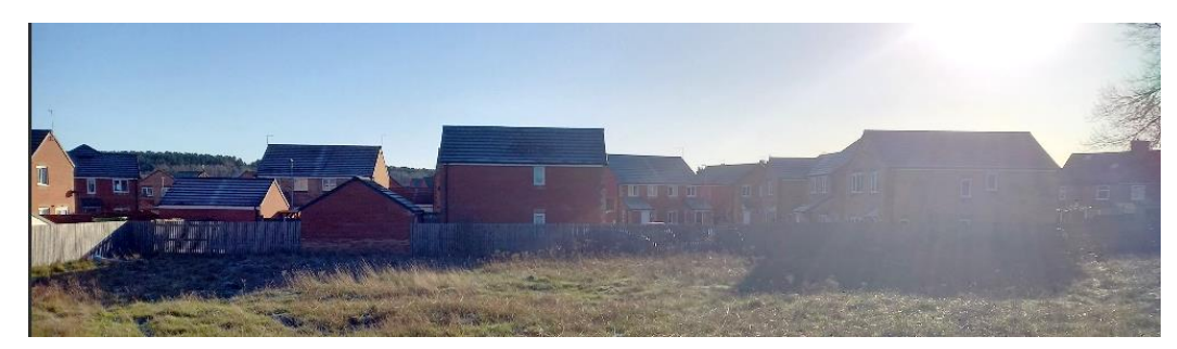
Side of recently constructed dwellings to the south of the site

7.20. The upper floor windows of the two recently constructed dwellings located to the south of the application site serve non habitable room windows (bathrooms and landing according to the approved plans for this development). The ground floor window on the side elevation of No 8 Barley Close is a secondary window serving a kitchen/diner (according to the approved plans for this development). Plot 5 would sit side onto No 8 Barley Close with a separation of over 3 metres to the shared boundary. Plots 1 and 2 would sit rear onto No 10 Barley Close at a distance of over 15 metres away. The ground floor windows on the side elevation of No 10 Barley Close serve non habitable rooms. Plot 1 would sit side onto the rear of Briar House at a distance of over 15 metres away and would not contain any windows in its west facing side elevation. All of these relationship/separation distances are considered acceptable.