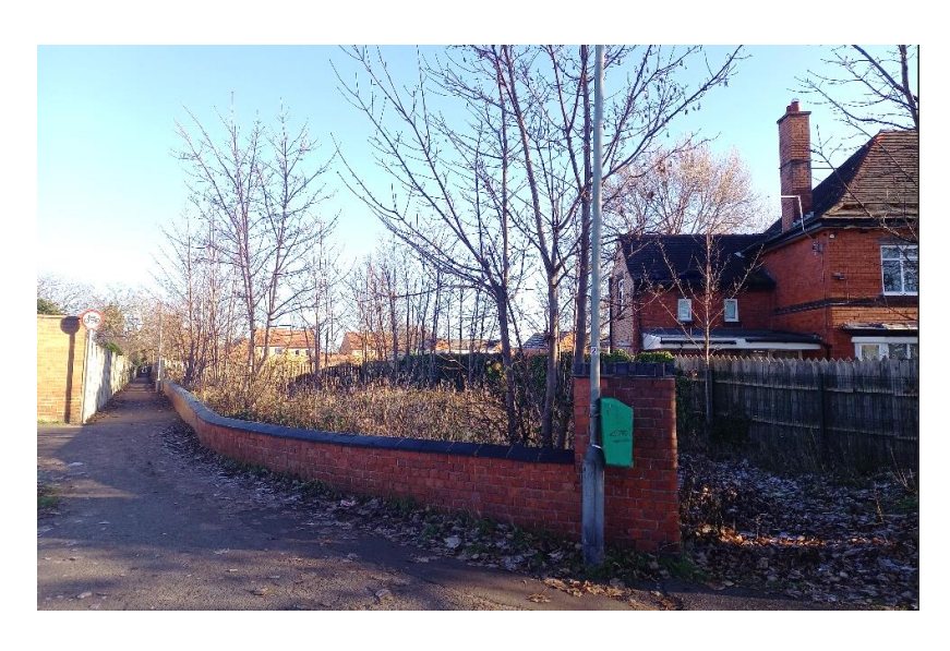
Position of proposed access off Church Circle, adjacent Briar House

7.23. Overall, it is considered that the proposed development would not result in an adverse impact on living conditions in accordance with Core Policy 9 and policy DM5 of the DPD.