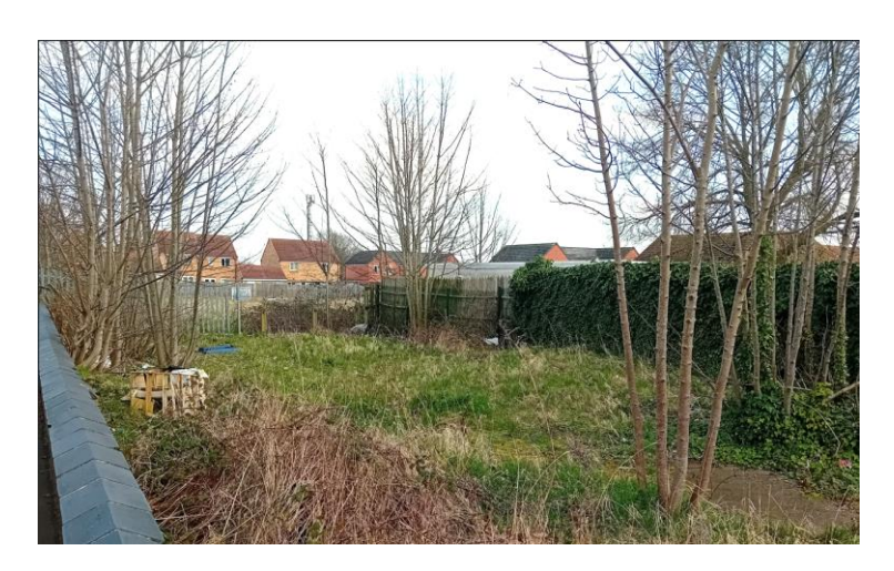
Trees proposed for removal around position of proposed access

7.28. An Arboricultural Report and Impact Assessment has been submitted with the application. This identifies 14 trees located either within or close to the application site. 10 of these trees are young self set sycamore trees which have been Graded as Category C trees. The submitted report states that all of these trees are proposed for removal to facilitate the proposed access to the site. There is no objection to their loss provided that adequate replacement planting is proposed. Whilst the scope for replacement planting is somewhat limited, it is considered that the proposed site layout has sufficient space available to accommodate a suitable soft landscape scheme. This is a matter that can be dealt with by planning condition with final details to be approved in writing in consultation with the Council's Tree and Landscape Officer.