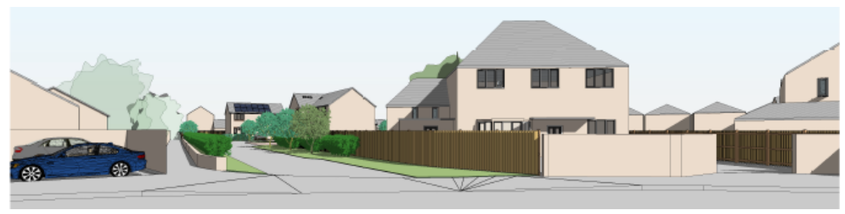
Proposed Street View from frontage of Briar House