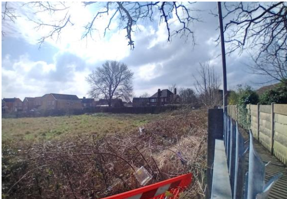
Mature trees on adjacent land (2 robinias to the north of the site and 1 poplar to the rear of Briar House)