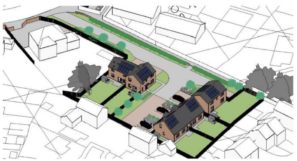
Proposed 3D Visual

3.6 The following documents have been submitted with the application: